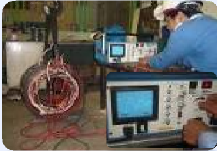
6.6KV Surge Comparison Test