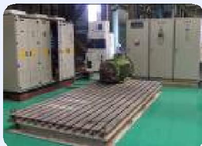
AC/DC Motor Test Drive up to 6.6KW 1200KW