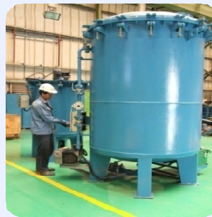
VPI System Ø1500 x 2000mm