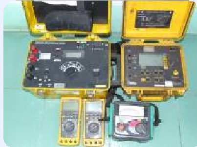
Digital Micro Ohms Meter, 3000GΩ/ 6.6KV Digital Insulation Tester