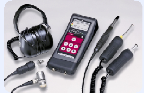
Vibration and shock pulse Tester