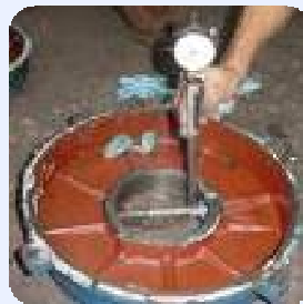
500mm Inside/Outside Micrometer And Bore gage