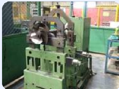
Balancing Machine 5500 Ton, Dia 1600 mm, Length 5 M.