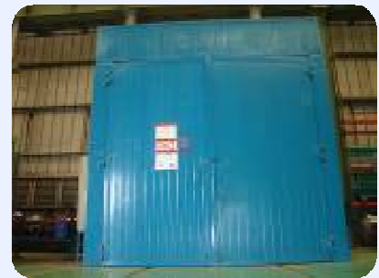
Electrical Oven (2x2x2) M 3 + (3x6x3) M 3