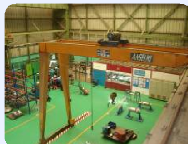
Gantry Crane "ASELMI" 5 Ton