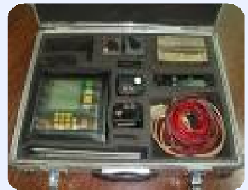
Laser alignment for belt